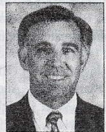
Your Nationwide® Agent