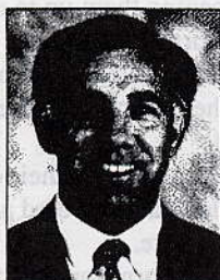
Your Nationwide® Agent