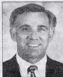
Your Nationwide® Agent